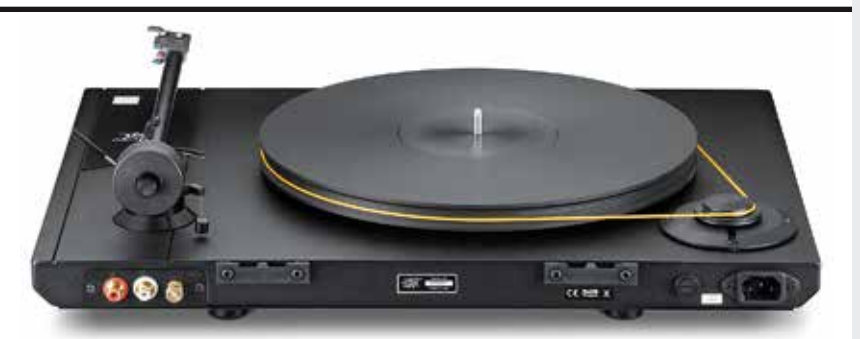
ABOVE: As with the UltraDeck, there's no external PSU here but a direct AC mains power connection. Tonearm wiring is terminated in RCA outputs and a ground post

being incremental. You know the drill because it is the definition of an upgrade path. The sheer wonder of the StudioDeck vs the UltraDeck is how perfectly its represents the gains without tickling the feet of the Law of Diminishing returns.